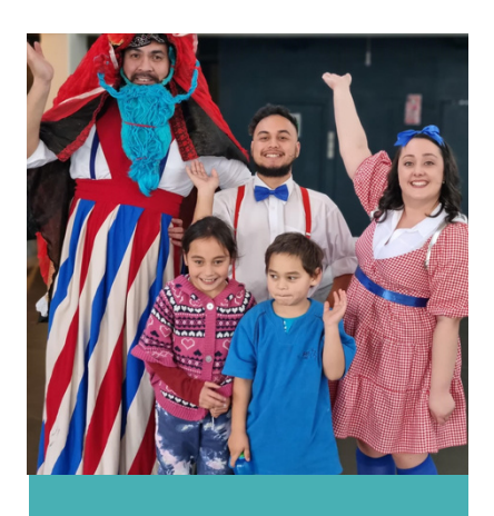
The Meteor Theatre donated tickets to Beards! Beards! Beards! for families we support! They had a blast.

A special thank you to our Wings members that support us through regular donations